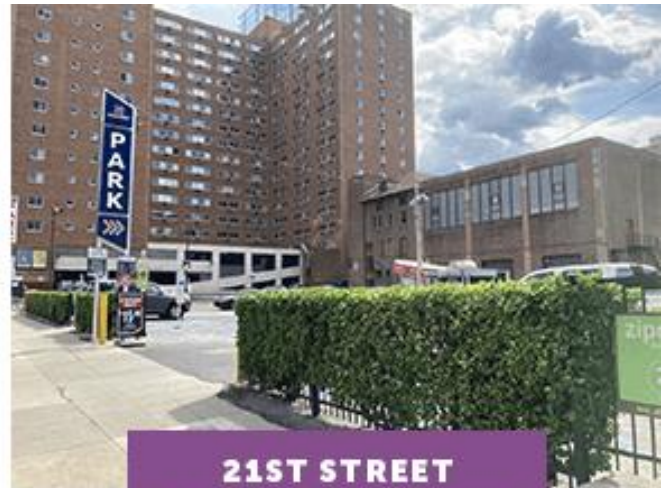
21ST STREET PARKING ENTRANCE

Unfortunately, there is not a parking lot associated with the building. Two paid lots are directly next to and behind the building. Pictured above is the entrance to the parking lot on Market Street, in between 22nd and 21st streets. The second photo is the entrance to the parking lot on 21st Street, in between Market and Chestnut streets. There is also metered on-street parking on most of the streets surrounding the Museum.