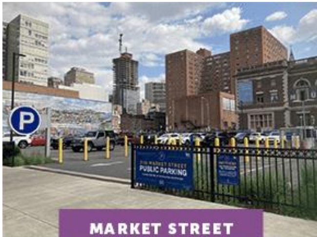
MARKET STREET PARKING ENTRANCE